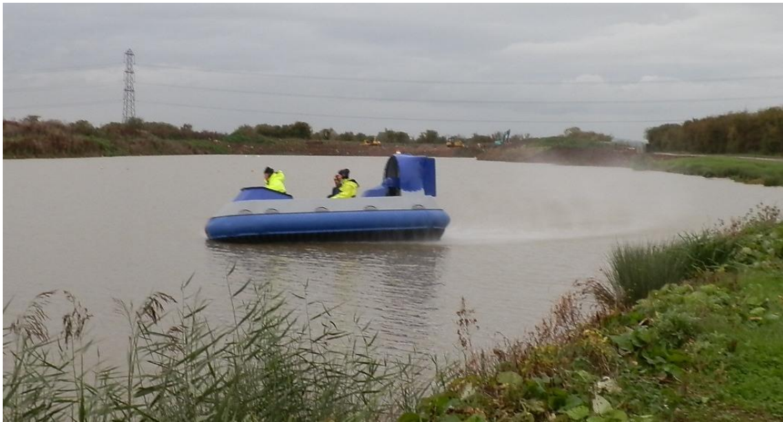
(Mistral under going trials)

This 4 / 5 seat all purpose craft is the replacement for the successful Vortex 3 & 4 range. The engines from Toyota Engine Developments are specifically tailored to our hovercraft needs. This craft is manufactured using the same high tech composite construction used in our UK, European and World Championship winning race craft, and the same attention to detail during construction as our racing craft.